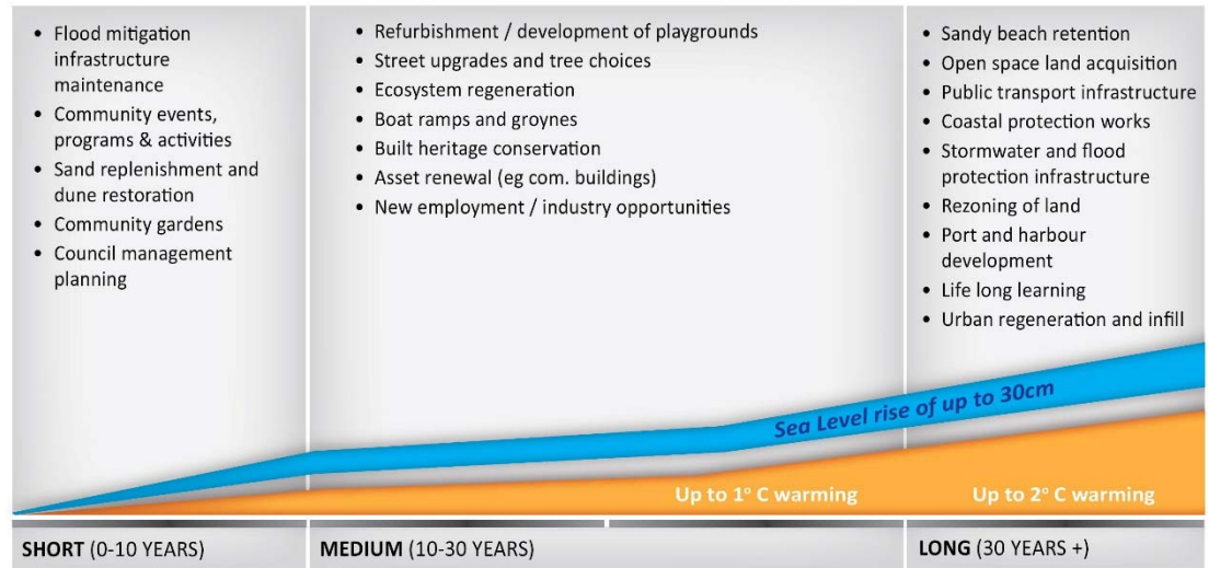
Figure 1.1: Western Adelaide key decision and decision lifetimes identified by stakeholders